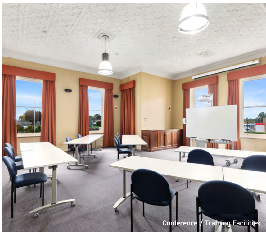
Conference / Training Facilities